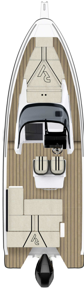
OPTION Back rest lower & raise, wetbar