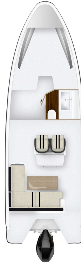
STANDARD Storage & Head