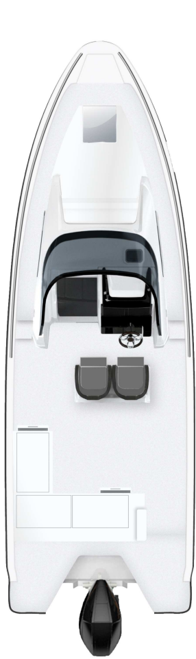
STANDARD Fiberglass deck