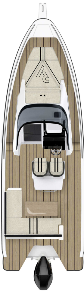
OPTION Table, wetbar, bench & bow upholstery